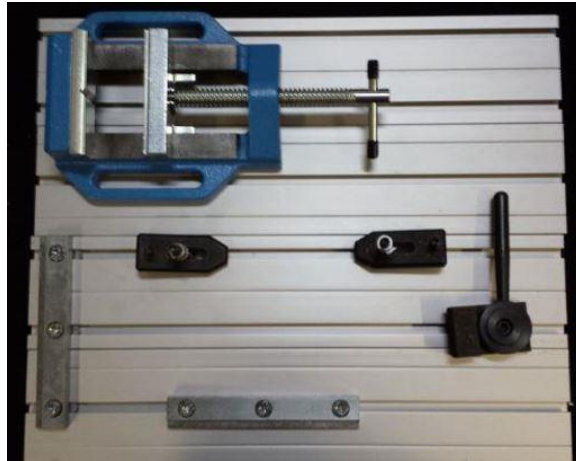
CY-50T Clamp Set - $795.00 15" x 12" x 1/2"